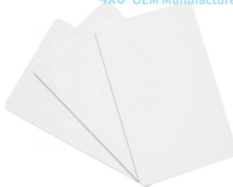
Check Scanner Cleaning Card 4X6 OEM Manufacturer

The substrate material is Blend Spunlace Cleaning Fabrics and it is pre-saturated with IPA solution and pouched in polyester laminated aluminum foil to provide excellent moisture vapor barrier properties.