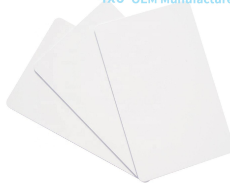
Check Scanner Cleaning Card 4x6 OEM Manufacturer

The substrate material is Blend Spunlace Cleaning Fabrics and it is pre-saturated with IPA solution and pouched in polyester laminated aluminum foil to provide excellent moisture vapor barrier properties.